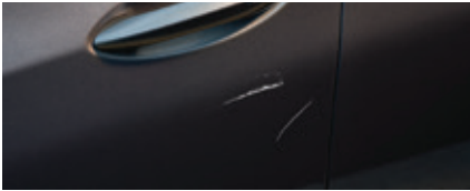
1 dent (more than 4") or 1 scratch (equal to or more than 6") per panel