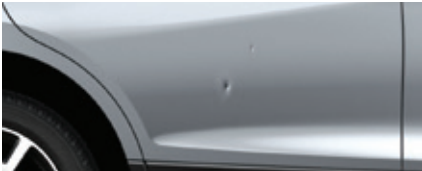
4 or more dings per panel