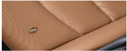
Upholstery holes more than 1/8"